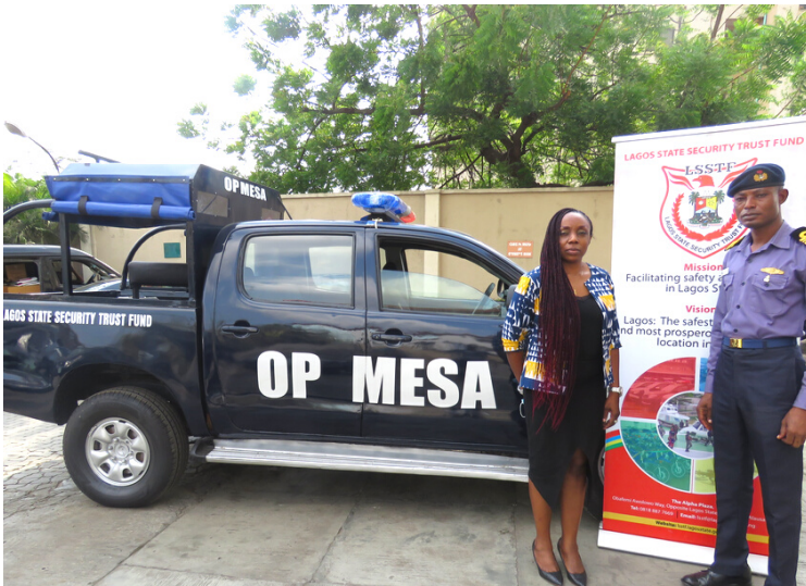
Presentation of a Pick-Up Trucks to the OP-MESA Navy