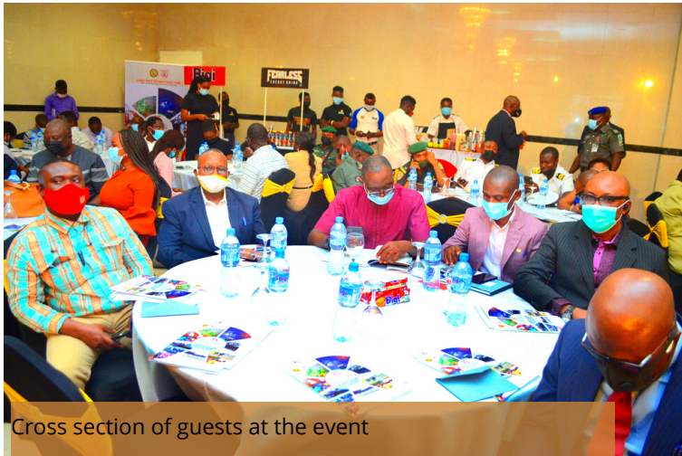
Cross section of guests at the event