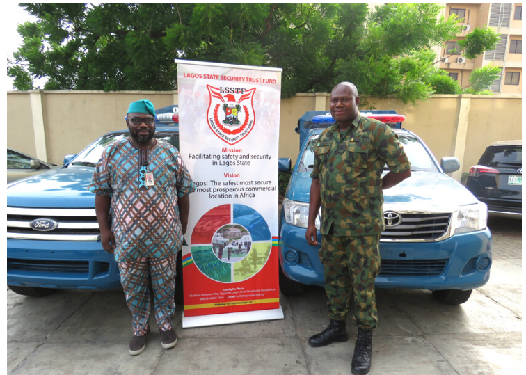
Presentation of 2 Pick-Up Trucks to the OP-MESA Airforce