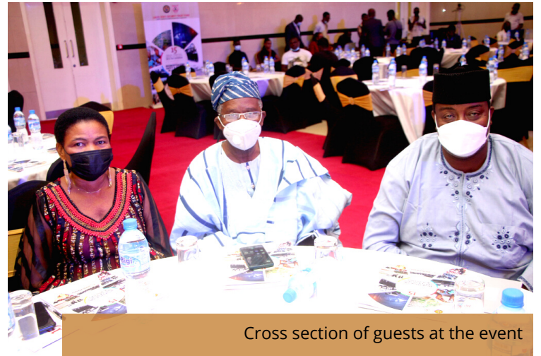
Cross section of guests at the event