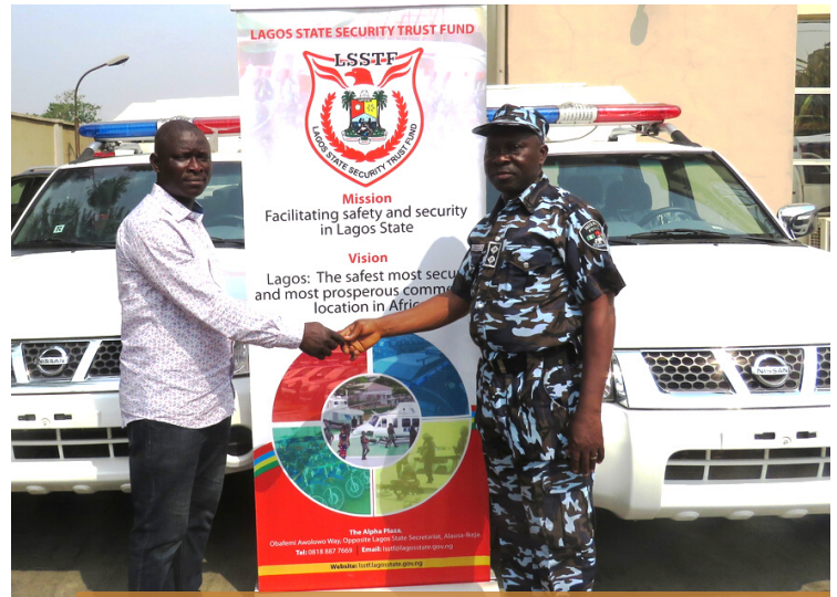
Presentation of 2 Nissan Pick-Up Trucks to the Lagos State Police Command