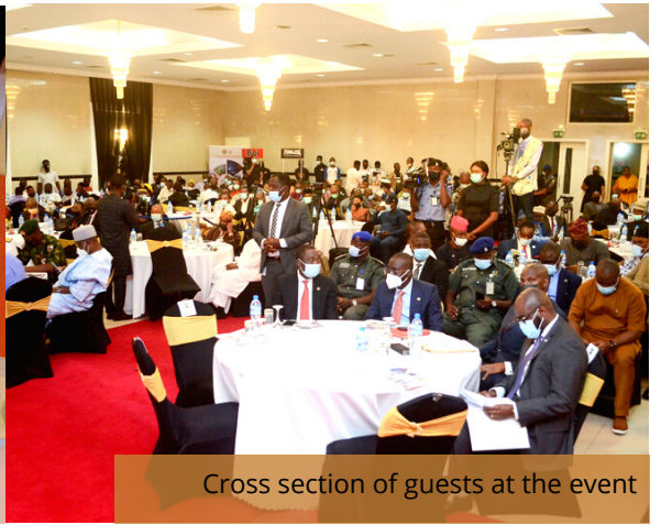
Cross section of guests at the event