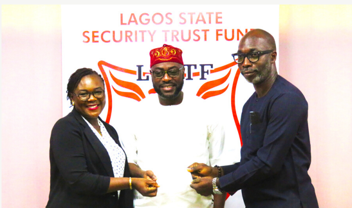
Representatives of Leadway Holdings Ltd. during the presentation of the company's donation of N5,000,000 to the Fund

It should however be noted that despite Lagos being perceived as the safest state in the country, it should not be taken for granted. The safer a state is perceived to be, the more the need to intensify efforts to keep it that way. Like it is said prevention is better than cure.