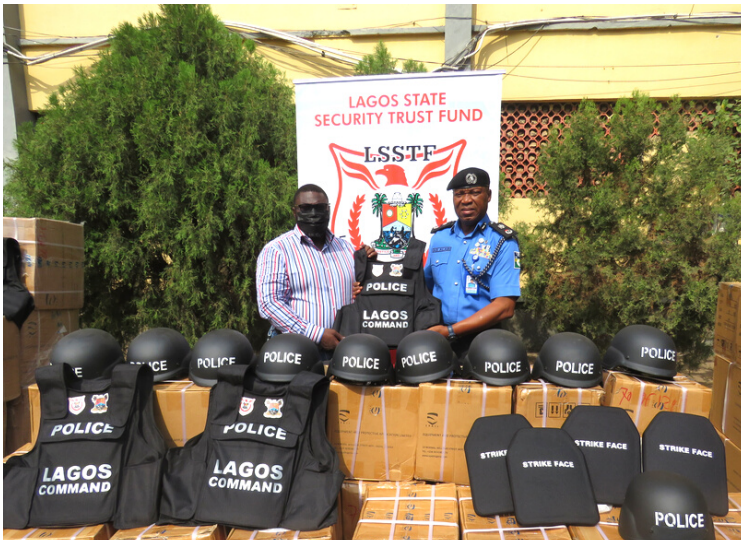
Admin. Director, LSSTF handing over 300 units each Bulletproof vests and Ballistic Helmets to the Lagos State Police Command