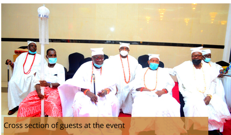
Cross section of guests at the event