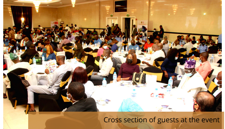
Cross section of guests at the event